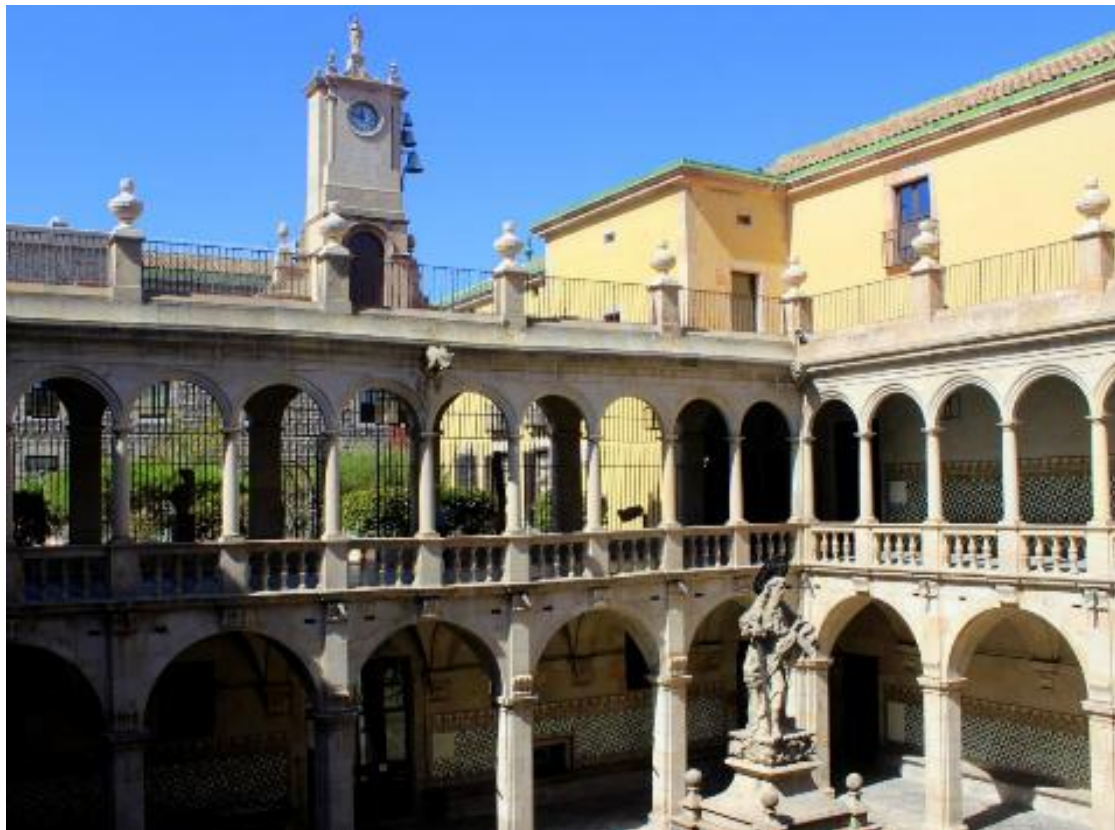
Cloister of the Institut d'Estudis Catalans, where the office is located

English has been adopted as the official language of the BKH, and therefore it is the language of all events organized by the BKH, though the BKH may also take part or collaborate in the organisation of events in other languages.